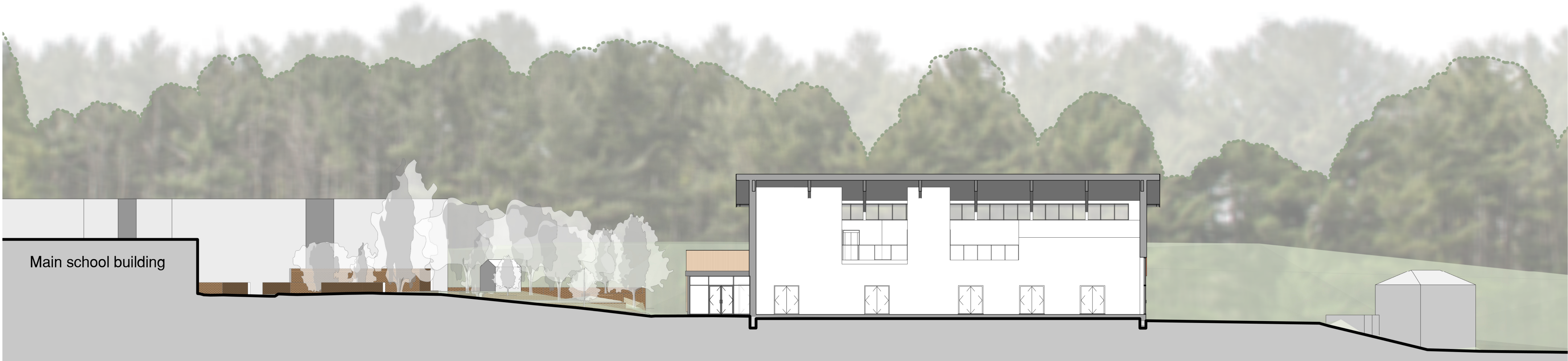
3 Section through site 1 : 200